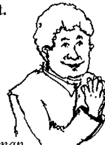
The proud man