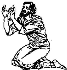
The humble man

Look at verse 14 and draw a line from each box to the man it suits best.