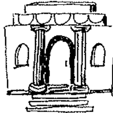
in the Temple