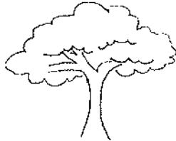
under a tree