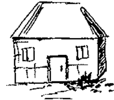
in a house